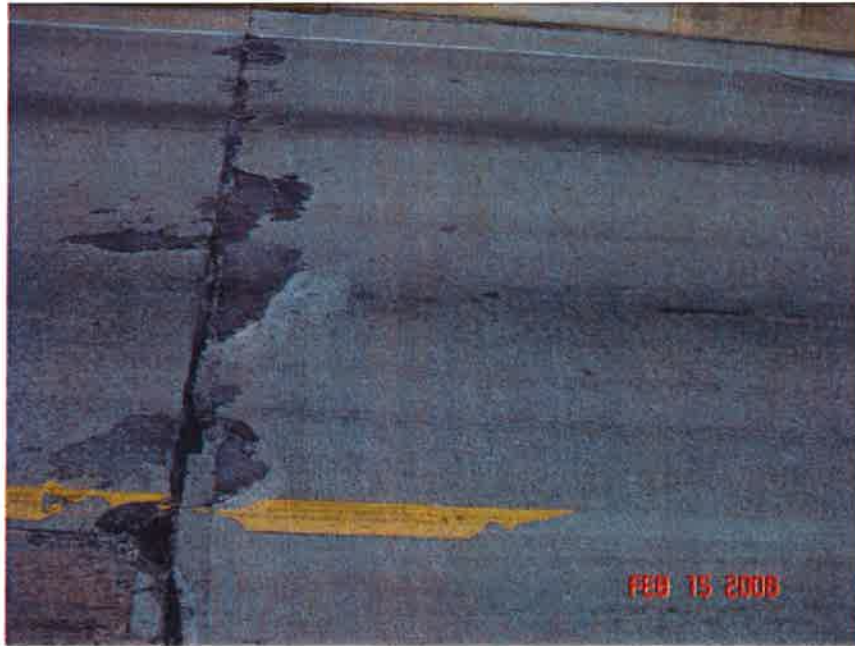
A/C B.O.'S - TYP.